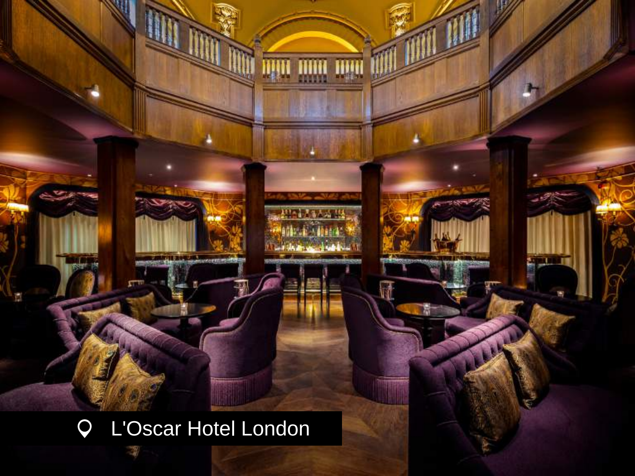
📍 L'Oscar Hotel London