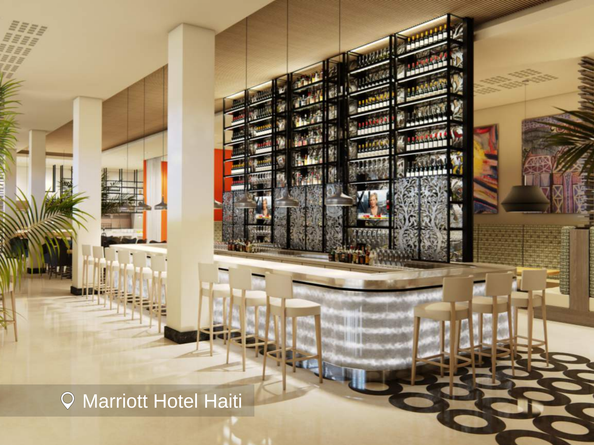
📍 Marriott Hotel Haiti