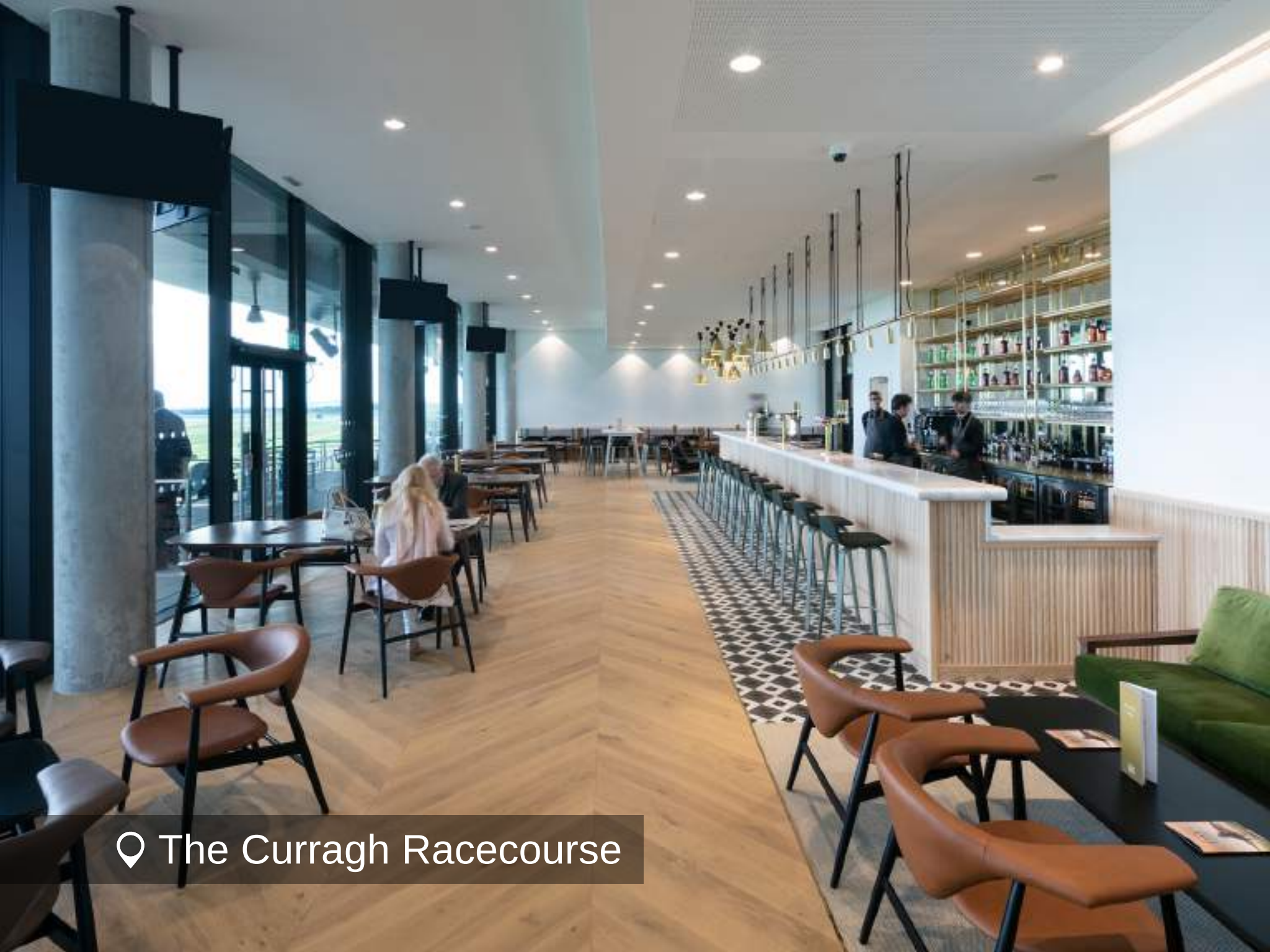
📍 The Curragh Racecourse